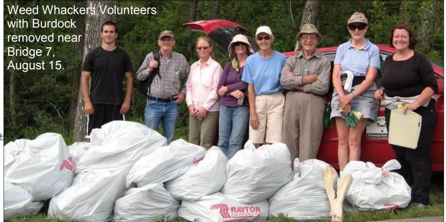
Weed Whackers Volunteers with Burdock removed near Bridge 7, August 15.

Across this province, native grasslands are threatened by non-native plant species, also known as invasives, and stormwater retrofit ponds can help to introduce invasive species to ecosystems in Fish Creek Provincial Park.