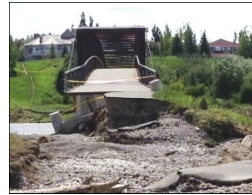
Bridge 14 near McKenzie