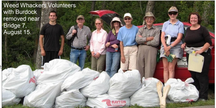
Weed Whackers Volunteers with Burdock removed near Bridge 7, August 15.

Across this province, native grasslands are threatened by non-native plant species, also known as invasives, and stormwater retrofit ponds can help to introduce invasive species to ecosystems in Fish Creek Provincial Park.