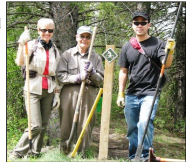
Volunteers near Bridge 4 , June 1.

Another Trail Care season has come to a close and the Friends would like to thank the Calgary Mountain Bike Alliance for their continued support, Alberta Parks and all the volunteers who helped out this year. On June 1, three volunteers helped to replace and repair 14 sign posts along the network between Shannon Terrace and Macleod Tr.