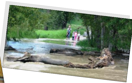
Flood education minibus tour (left) Flooded trail near Bow Valley Ranch (above).