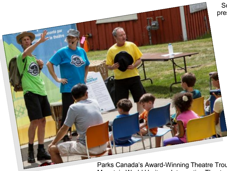
Parks Canada's Award-Winning Theatre Troupe, Mountain World Heritage Interpretive Theatre at Creekfest.