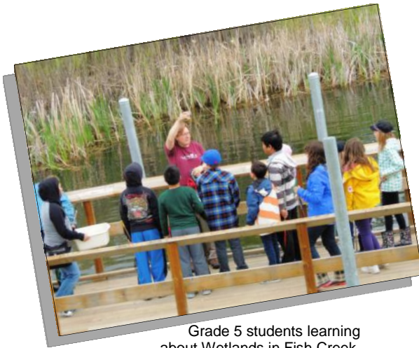
Grade 5 students learning about Wetlands in Fish Creek.