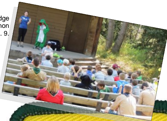
Scout Naturalist Badge presentation at Shannon Terrace, Sep. 9.

On Sunday July 21 the Friends of Fish Creek hosted the 3 rd Annual Creekfest at the Bow Valley Ranch and approximately 2200 people attended this one-day celebration of water. Creekfest is an important component to the Friends' Watershed Public Awareness Campaign, designed to inform and inspire community members to take actions to protect and conserve our water. 21 volunteers contributed over 80 hours to helping this event run smoothly.