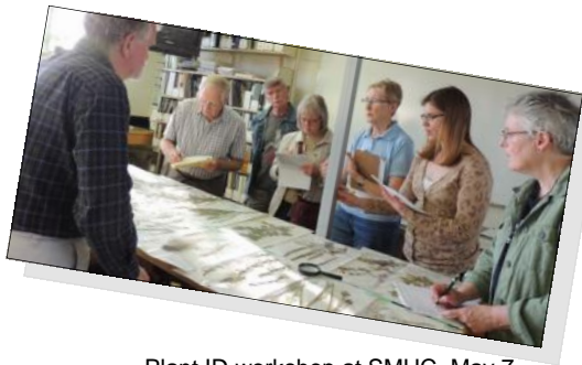
Plant ID workshop at SMUC, May 7.

Between April and October, 13 volunteers contributed approximately 160 hours to recording and photo-documenting 120 plant species in the Lafarge Meadows area. A summary report was produced as well as an online plant image library the public can use to brush up on plant ID skills. Special thanks to Land Stewardship Centre, Glenbow Ranch Park Foundation, Cows & Fish, St. Mary's University College and Tannas Conservation Services for supporting this pilot project.