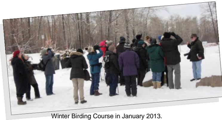
Winter Birding Course in January 2013.

Looking back over 2013 my overall impression is one of pride in our team and gratitude to our amazing volunteers and donors. We worked hard this year on developing new programs to provide more opportunities to learn about, conserve and enjoy our wonderful park.