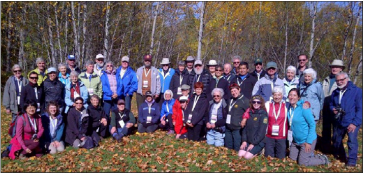
2015 Alberta Parks Volunteer Conference, Sep 25-27 at Calhoun Bay.