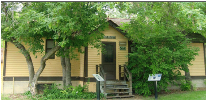
The Cookhouse, Friends of Fish Creek office at the Bow Valley Ranch in Fish Creek

The Friends of Fish Creek is a registered society in Alberta and as such is bound to the Societies Act. We have enacted bylaws that require a Board of Directors, made up from members of the Friends, to oversee our operations. This covers setting strategic objectives, preparing a budget to raise and disburse funds, as well as making sure we have appropriate banking, insurance, operating policies, stakeholder and membership relations, and productive employees and contractors.