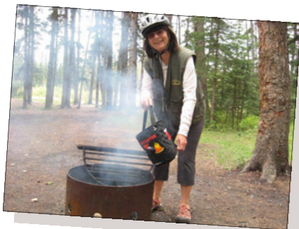
Park Watch Steward dousing fire.

Park Watch – one of the Friends' flagship programs – is our longest running program to date. Teams of volunteer stewards walk or cycle the park's trails, passing on observations to Parks Conservation Officers and management related to vandalism, litter, invasive species, public safety and the different types of park use enjoyed by the public.