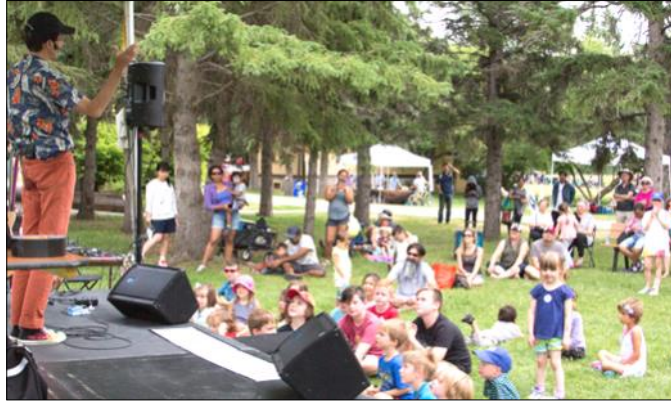
Peter Puffin's Whale Tales at Parks Day & Creekfest on July 15.

This year, close to 2000 community members celebrated Canada 150 and the 25 th anniversary of the Friends of Fish Creek with us at Parks Day & Creekfest on July 15. This one-day event is an important component to our watershed awareness campaign, that encourages environmental stewardship and highlights this province's protected parks.