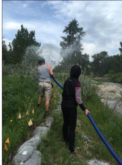
Friends' volunteer and staff trying out our new water pump at the Hull's Wood site on May 31.

Since 2014, the Friends have actively worked with various community partners and volunteers to plan and implement successful riparian restoration projects along the banks of Fish Creek. Direction from other watershed stewardship groups such as Cows and Fish and Trout Unlimited Canada helped us learn how to approach these projects, and hands on support from partners like the Venturers Society, various corporate groups and our own unwavering volunteers ensured that we were able to get the work done. Our partnership with Alberta Environment and Parks is also key, as they provide the necessary permits to work in the park, along with consultation and staff support, and the provision of tools and equipment to which we wouldn't normally have access. What started out as an experiment has now become one of our core programs that will continue to grow in the coming years as we work to engage more volunteers in lead roles for the planning, assessment, monitoring and maintenance of future restoration sites. The scope of these projects is significant, and while we could not do them without the support of our volunteers and partners, they would also not be possible without the financial support of a few key funders. Since 2014, both the Alberta Conservation Association and the Land Stewardship Centre have