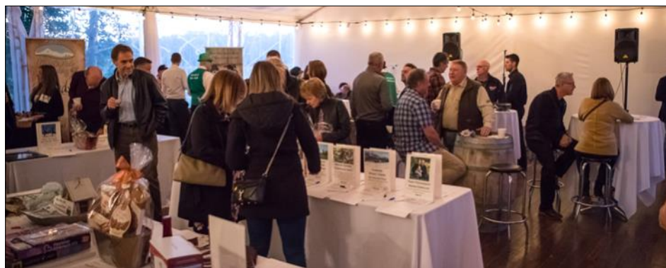
Attendees bidding on the selection of 50 silent auction items on September 15.

Close to 90 people attended the fourth annual A Taste of Autumn – Wine & Beer Tasting and Silent Auction Fundraiser on Friday, Sep 15 and welcomed this magical season of change in Fish