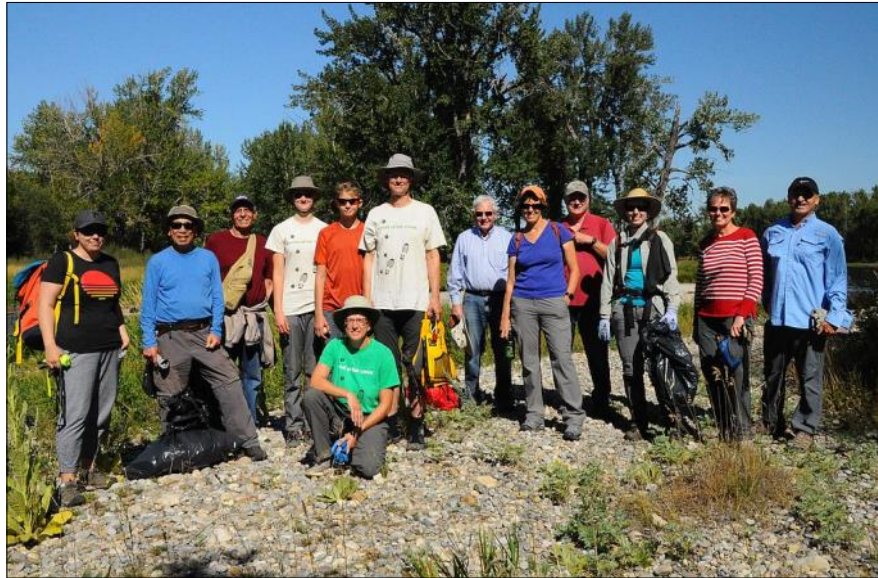
Poplar Island flood debris clean-up volunteers, August 28, 2017.

September 2016... Volunteers from the Bow Waters Canoe Club help scout out non-natural debris on Poplar