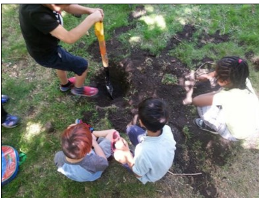
CUPS (Calgary Urban Project Society) volunteers planting trees on May 24.