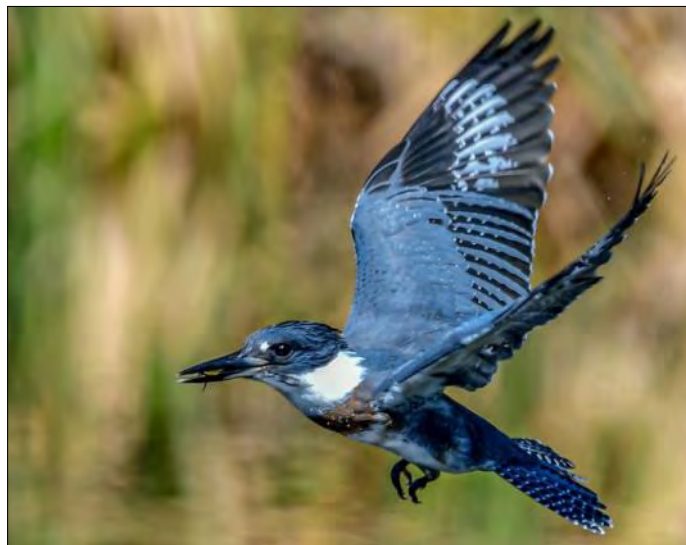
Belted Kingfisher, Bottom left: Red-Necked Grebe