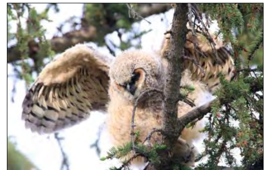
Owlet getting ready to take flight. Top left: mother and baby in the nest.

In order to provide constant warmth and protection, the female must remain on the nest until the youngest is about 35 days old.