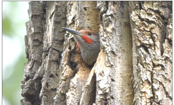
Northern Flicker at Hull's Wood, photo courtesy of Aiden Ducharme. Bottom left, Poplar Planting with volunteers on May 25 at Hull's Wood.

forest for shelter and food. Pileated woodpeckers are one of the many bird species that