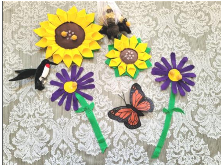
Pollinator pollen transfer game (I made the flowers, bought the puppets and "pollen" pompoms).