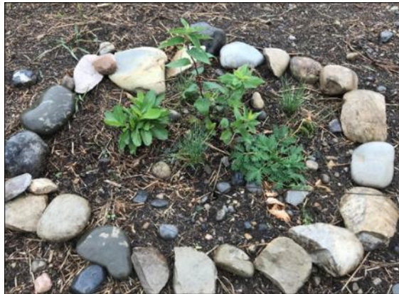
Native grasslands plugs including wild bergamot and Foothills rough fescue.

Between April and June, the Friends were hard at work preparing for seeding and planting native seeds and plugs in the grasslands around the Bow Valley Ranch. Expanding on the 0.5 hectare ATCO Heritage Grassland site, which was created in 2016, a 6 ha area around the site is now being managed to prevent the encroachment of smooth brome and other invasive species. The field