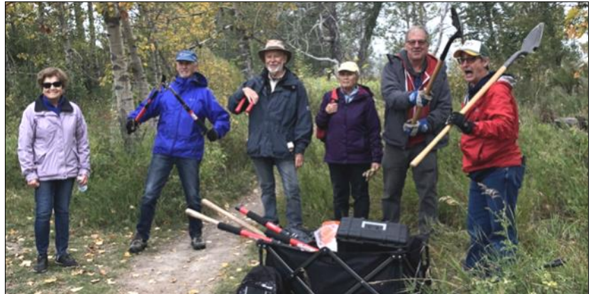
Rotary Club volunteers helping with Restoration.

Volunteers will receive training from the Alberta Riparian Habitat Management Society (Cows and Fish) to evaluate the health of the riparian areas along Fish Creek and aid in planning our future restoration projects. In the training, you will learn how to identify common native and invasive plant species and use the scoring criteria provided to conduct assessments with a team along the creek over the program activity period.