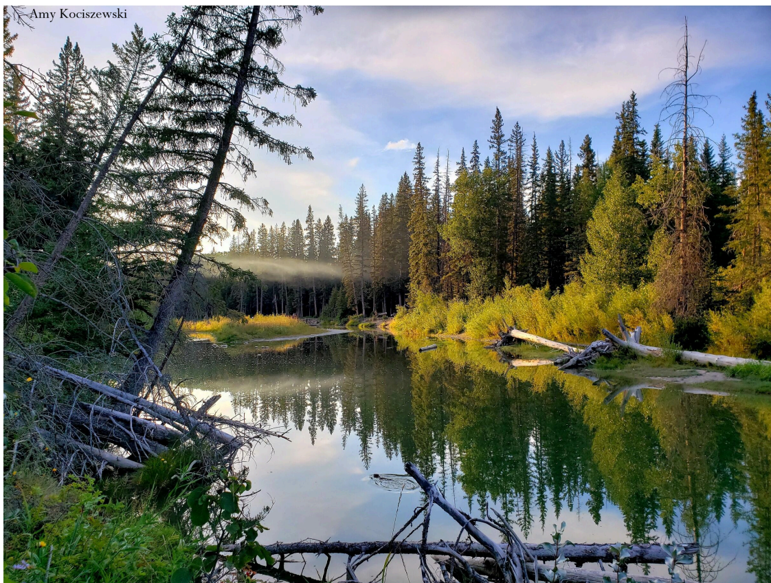
Adult-My Park-Amy Kociszewski-Bebo Grove-Quiet Reflections