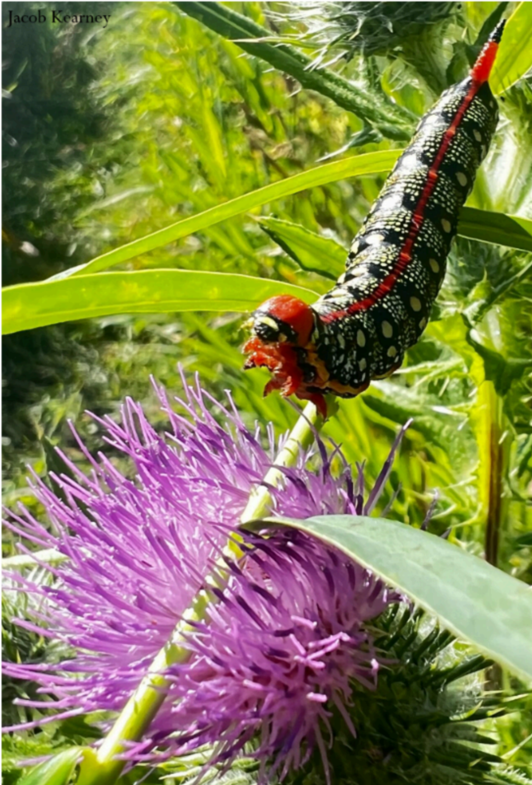
Youth-True Color-Jacob Kearney-Burnsmead-Why Did The Caterpillar Cross The Branch