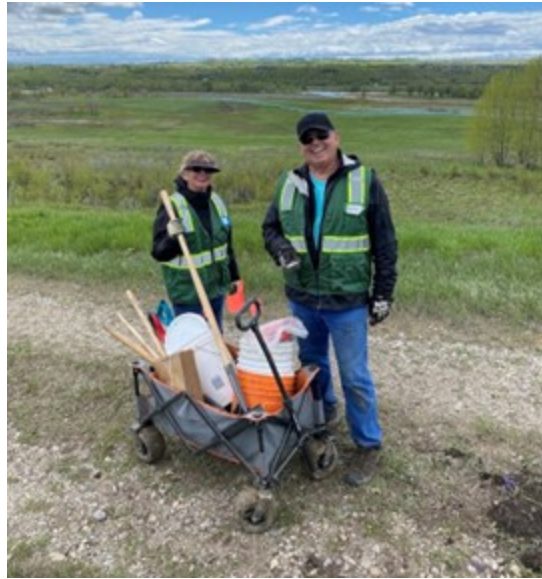
Volunteers at the Genesis Development Corps Logan Landing property, south of Seton, SE. Wagons, buckets and shovels are used to dig up plants and move them to their new homes in Fish Creek Provincial Park.

providing the ANPR with access to a Calbridge Developers and Qualico property in SW Cochrane. Through these partnerships, the Friends have rescued over 15,000 native plants this year, providing an in-kind value of $112,500.00 to our ongoing restoration projects. The salvaged plants were added to our grassland restoration project in the Bow Valley Ranch day use area, converting 1,500 m 2 of smooth brome-Kentucky bluegrass to Foothills rough fescue grassland.