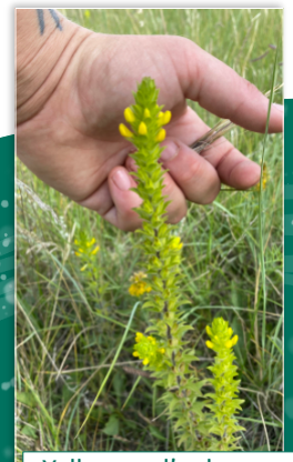
Yellow owl's clover Orthocarpus luteus