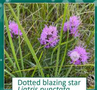
Dotted blazing star Liatris punctata