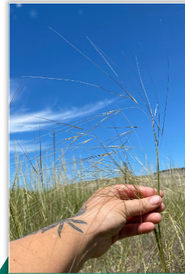
Porcupine grass Hesperostipa curtiseta

Here's a look at just a few of the incredible species we've been lucky enough to rescue this year. We hope you enjoy the beauty of these amazing native plants and grasses. If you want to get involved in plant salvage, you can volunteer to come out with us on weekends to help rescue plants for grassland restoration (or grab some for your own garden).