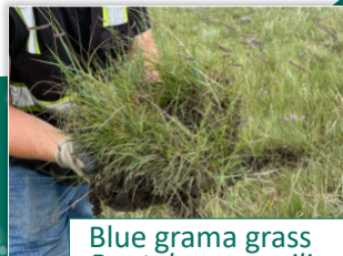
Blue grama grass Bouteloua gracilis