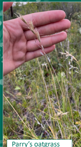
Parry's oatgrass Danthonia parryi