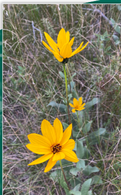
Rhombic leaved sunflower Helianthus pauciflorus subrhomboides