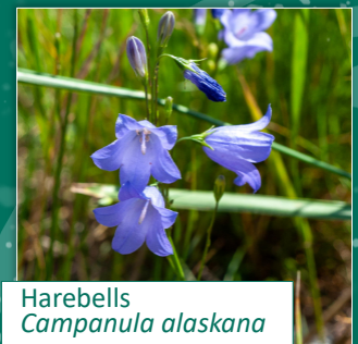
Harebells Campanula alaskana